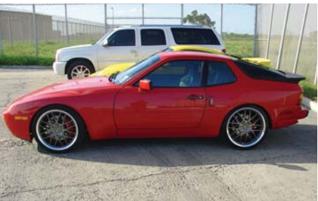
Vehicles seized by ICE that were purchased with illicit proceeds from narcotics smuggling.