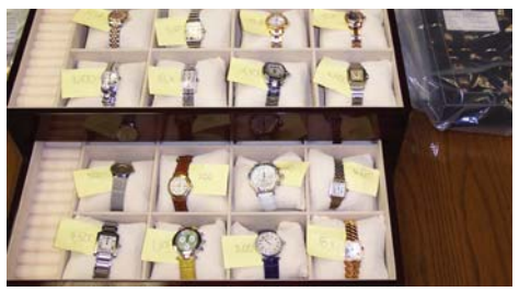
Seized luxury jewelry discovered during execution of search warrants.

The case saw another critical development on May 31, 2007, when Oscar and Tina Oropeza were stopped for traffic violations by local police in Mobile, Alabama. Oscar Oropeza gave verbal consent to search their van, which revealed a hidden compartment in the floor area. The officers discovered four aluminum containers concealed within the compartment containing 84 packages wrapped in plastic wrap and duct tape. The packages contained a white powdery substance that field tested positive for