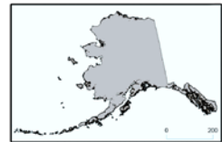
Alaska (Seattle AOR)